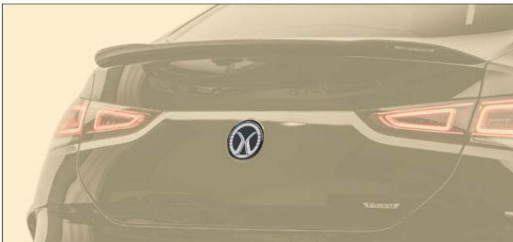
Rear hatch emblem