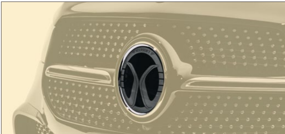
MANSORY logo for grill mask