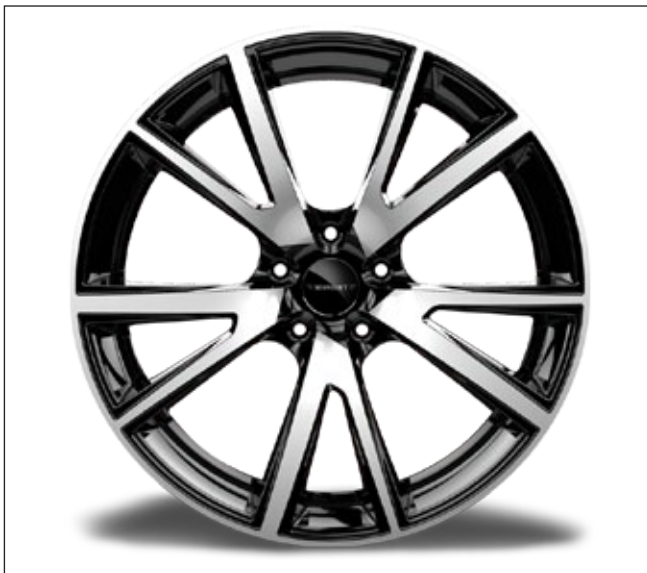
Y.5 wheel 23 inch