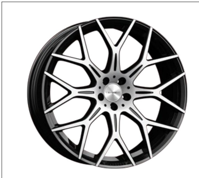
N.80 Wheels 23inch

✂ recommended tyre size - 295/35 23 Continental SC6 ⓘ Spacer adapters kit must be ordered separately