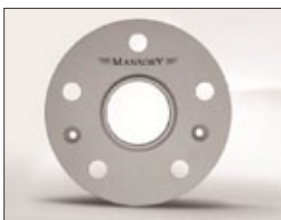
Spacer adapter kit for 23 inch wheel

✂ recommended tyre size - FA: 285/40 33, RA 325/35 22 ⓘ N.50 22 inch wheel compatible without spacer