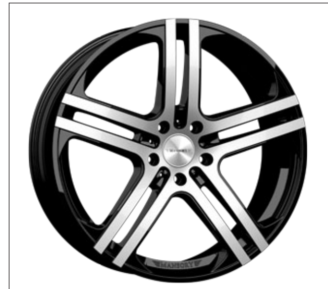
N.50 Wheels 23 inch

✂ recommended tyre size - 295/35 23 Continental SC6 ⓘ Spacer adapters kit must be ordered separately