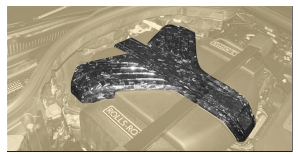
Engine cover with MANSORY logo