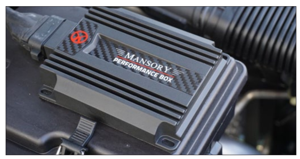
MANSORY Performance PowerBox +84 PS +124NM +20KM/H

Middle and X-pipes, Muffler ① Only for export!