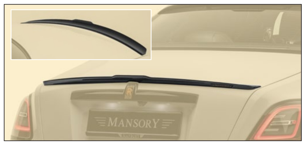
Rear decklid spoiler I. visible carbon fibre primed without clear coat