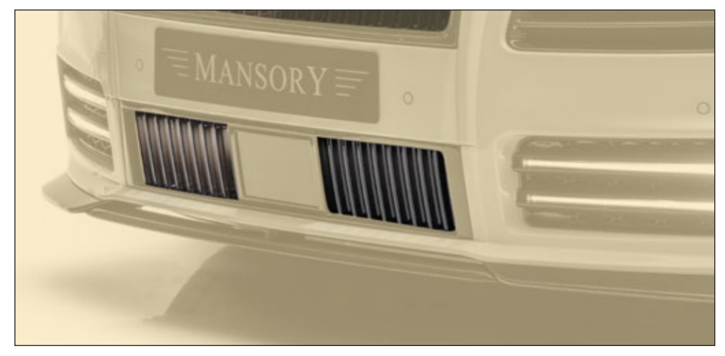
Ambiente front bumper Illumination addition Illumination 2 parts set *compatible only with mansory wide body kit