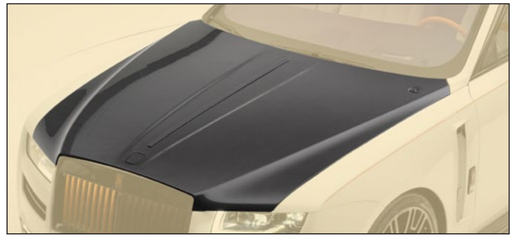
Engine bonnet with bar exposed visible carbon fibre primed without clear coat