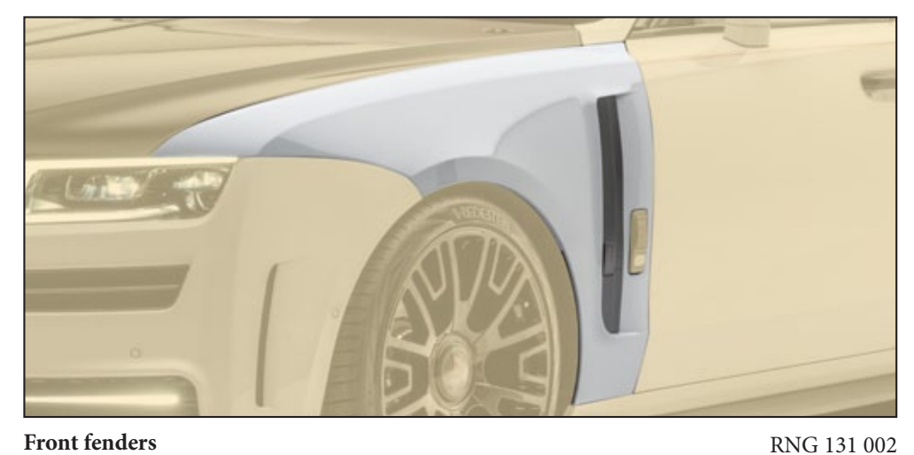
Front fenders 2 parts set - left & right 2 parts set of emblem with MANSORY logo