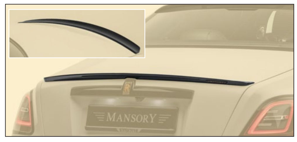
Rear decklid spoiler II. flat visible carbon fibre primed without clear coat