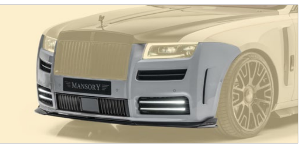
Front bumper slim DRL with air outletRNG 102 182front lip visible carbon fibre primed without clear coat, middle slats chrome<br/>daytime running lights,(1)① compatible for cars with or without ACC sensor

front lip visible carbon fibre primed without clear coat, middle slats chrome without air outlet, daytime running lights (i) compatible for cars with or without ACC sensor