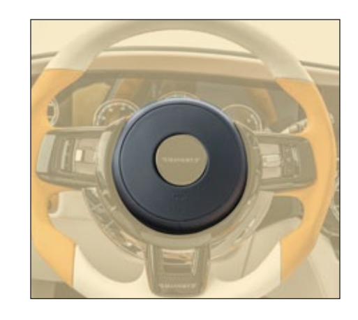
Airbag coverRNG 351 500available with leather, alcantara,() modification only, OE-part required