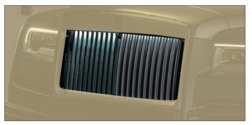
Ambiente grille Illumination with two tone painting lamels addition Illumination with manual switch * installation remain reserved at Mansory headquarters