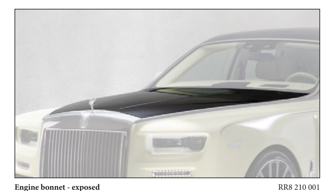
Bar for engine bonnet visible carbon fibre glossy*