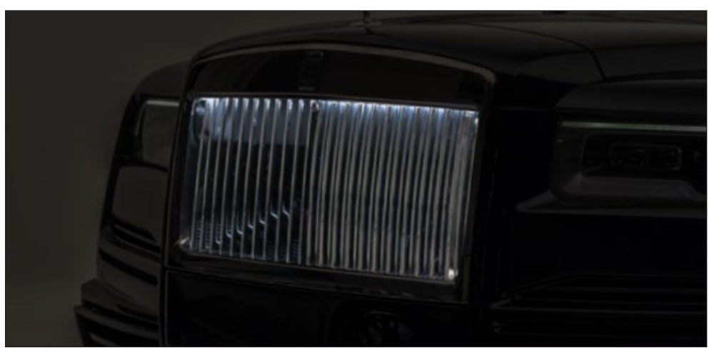
Ambiente grille Illumination addition Illumination with manual switch